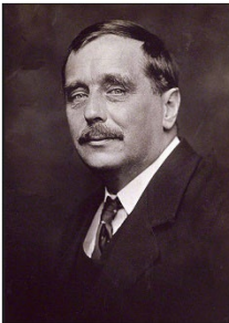
Author: H G Wells (1920)

Herbert George Wells (21 September 1866 – 13 August 1946) was an English writer. Prolific in many genres, he wrote more than fifty novels and dozens of short stories. His non-fiction output included works of social commentary, politics, history, popular science, satire, biography and autobiography. Wells is now best remembered for his science fiction novels and has been called the ‘father of science fiction’. (Wikipedia 7 Apr 2023)